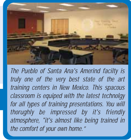
The Pueblo of Santa Ana's Amerind facility is truly one of the very best state of the art training centers in New Mexico. This spacious classroom is equipped with the latest technology for all types of training presentations. You will thoroughly be impressed by it's friendly atmosphere, "it's almost like being trained in the comfort of your own home."

3:15 pm to 4:30 pm SECTION 9 - Cold Weather Operations - How water temperature affects the chemistry and biology of a lagoon system. How temperature affects pond mixing. Cold weather operations. Predicting water quality based on changes in temperature. Wrap up. Case study on actual lagoons meeting very high effluent quality standards, and the costs of one city's painful lagoon decommissioning. Evaluations and Certificates